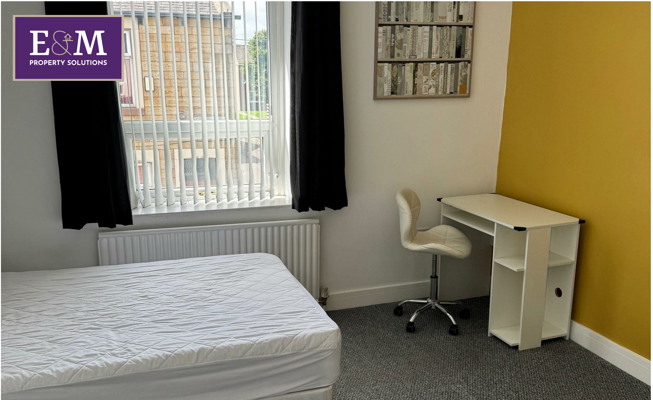
Room 5, 2-4 Fir Street, Burnley, Lancashire, BB10 4AL £115 Per week